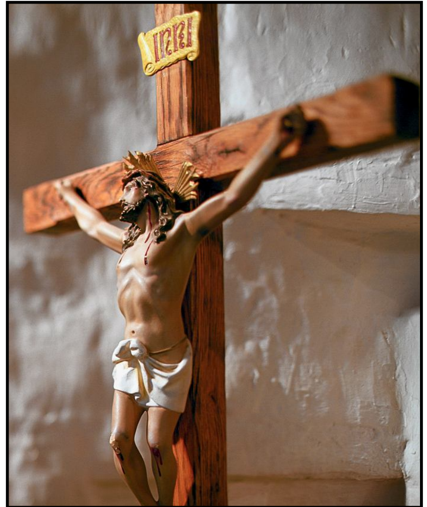
Beauty in the Midst of Darkness "The Fellowship of His Suffering"